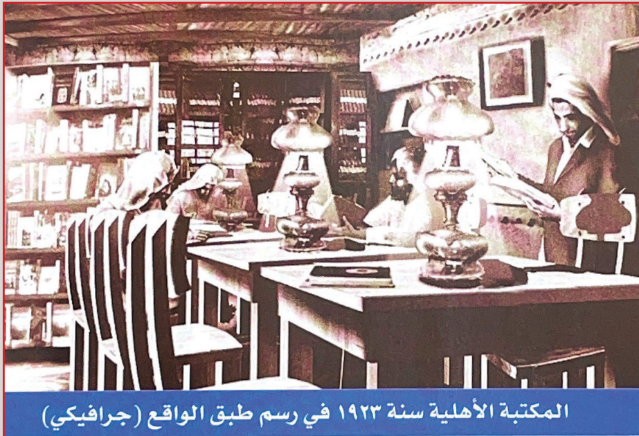
المكتبة الأهلية سنة ١٩٢٣ في رسم طبق الواقع (جرافيك)